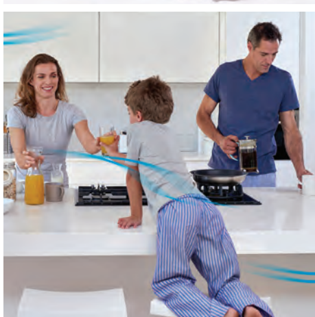
Skylights, Ventilation – Roof, Room and Whole House