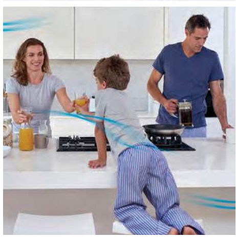
Skylights, Ventilation – Roof, Room and Whole House